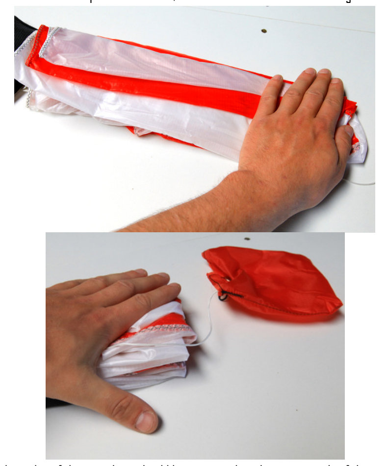
The trailing edge of the parachute should be positioned on the opening side of the container.