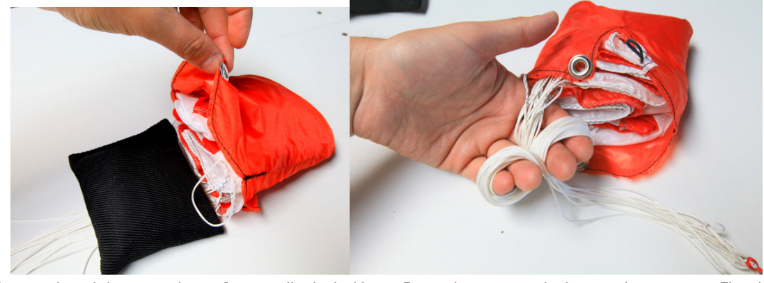
Grab the lines and wind them round your fingers till it looks like an 8 in order to store the lines in the container. Then house the lines inside the container just in front of the parachute's trailing edge.