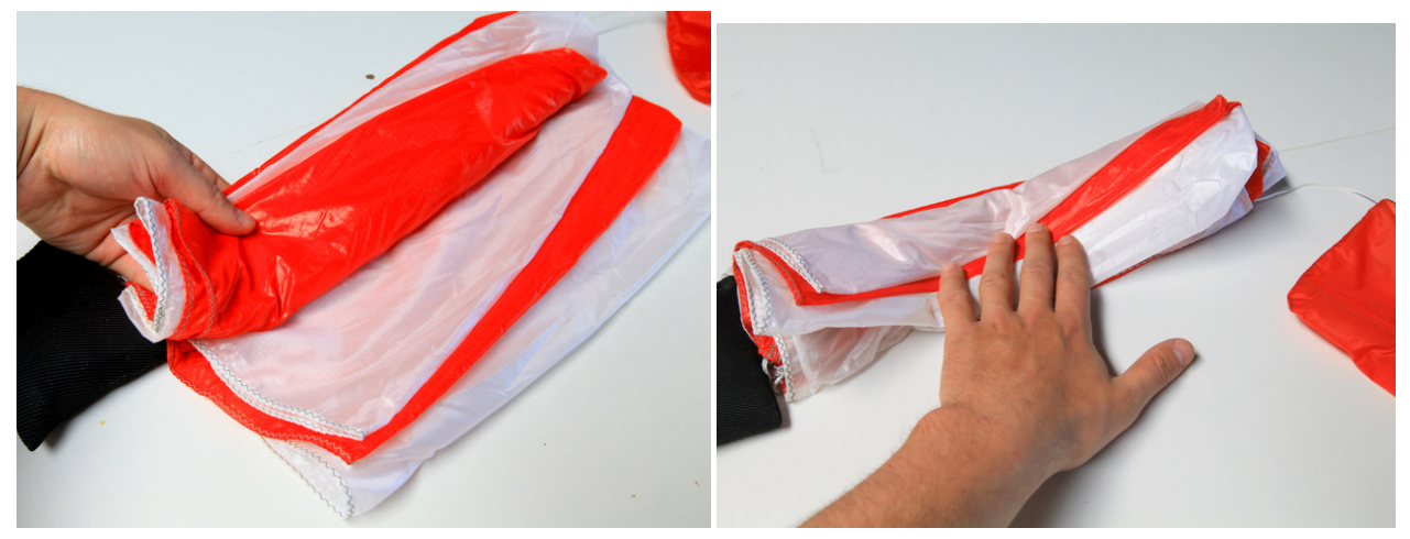
Now we have the short side of the parachute folded, it is now time to fold it 3 times to get it fit in the container.