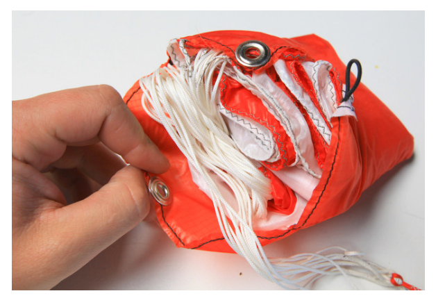
Use the black elastic loop to close the container, as shown below.