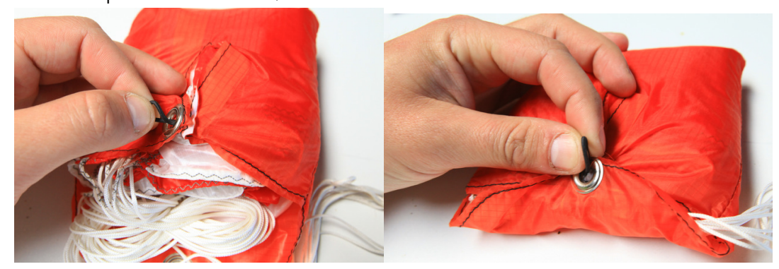
Once the container is closed, use 3 or 4 lines to fully make sure it will stay closed till you want it to open.